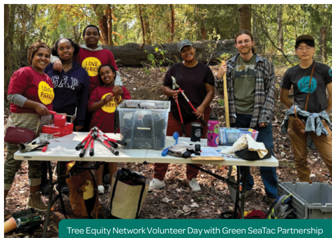
Tree Equity Network Volunteer Day with Green SeaTac Partnership

Our partners in the Tree Equity Network share a common goal of protecting and building awareness about the importance of trees. The wide range of experiences, access, and expertise that exists within the network allows for cross-sector and cross-neighborhood collaboration. Sharing resources and connections among the network broadens each partner's ability to protect and plant more trees to benefit the health and well-being of people in our region.