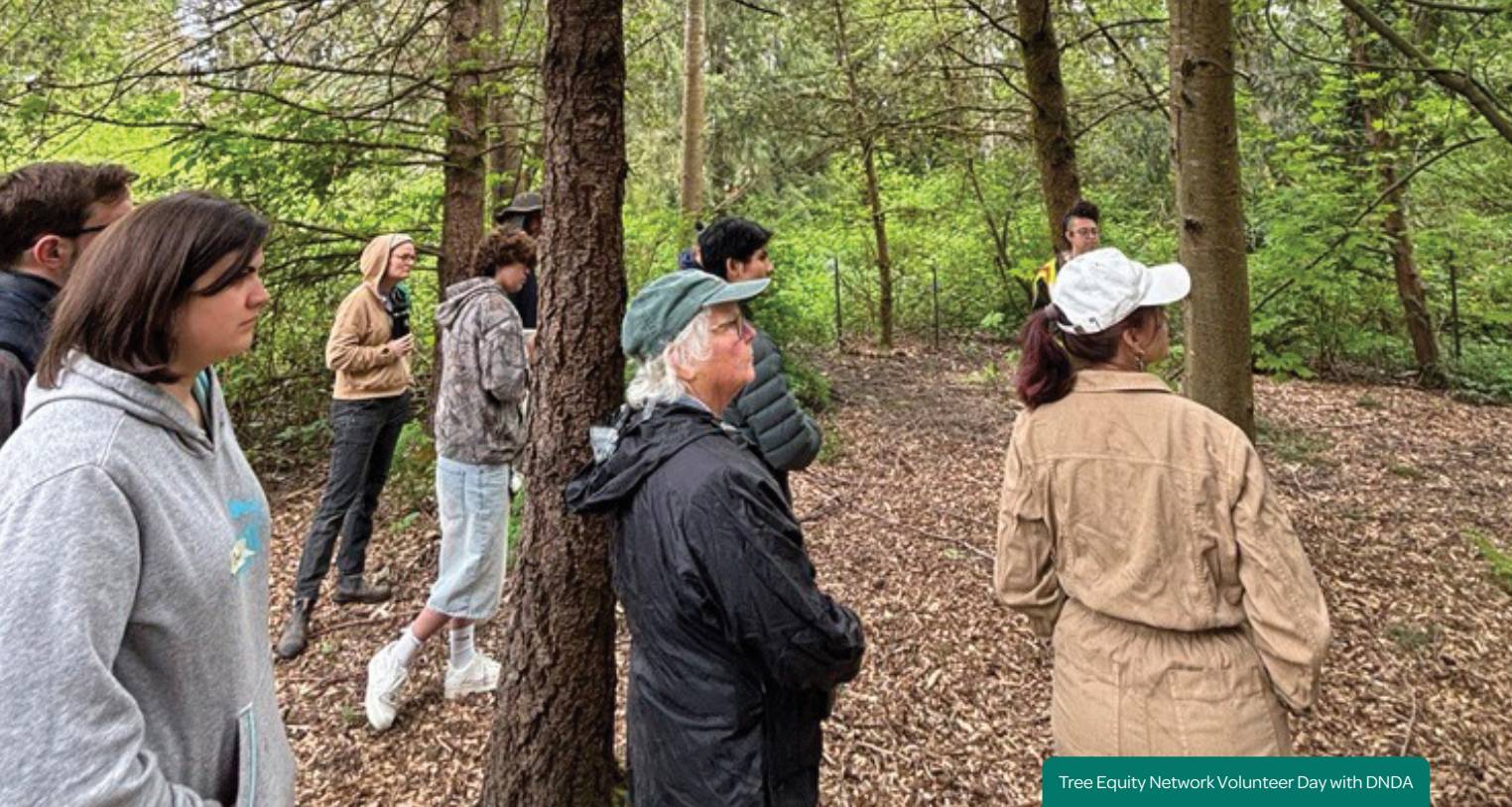
Tree Equity Network Volunteer Day with DNDA