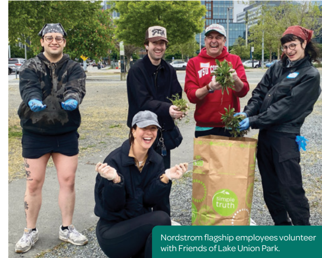
Nordstrom flagship employees volunteer with Friends of Lake Union Park.

In August, voters had the opportunity to renew funding for over 250 parks, playfields, swimming pools, and hands-on learning destinations—in every city and across rural King County. We are grateful that the King County Parks Levy has been renewed with over 70% support from parks lovers like you. Thank you for voting with parks and public spaces in mind!